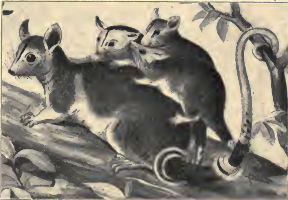
FIG. 1. CALUROMYS DERBIANUS. EARL OF DERBY'S OPOSSUM.